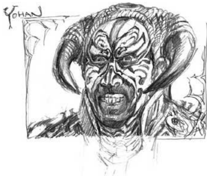
The preliminary sketch for Johan.